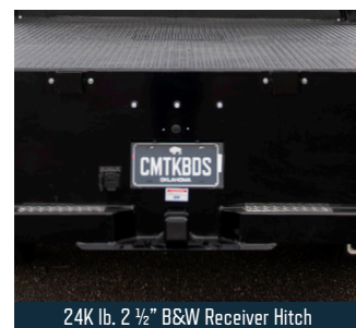
24K lb. 2 1/2" B&W Receiver Hitch