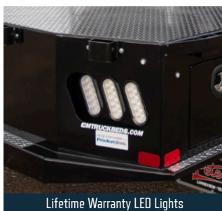
Lifetime Warranty LED Lights