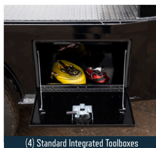
(4) Standard Integrated Toolboxes

NOTABLE OPTIONS INCLUDE: 3/16" Heavy-Duty Deck, Steel SK Deluxe can have Flush Mount 30K lb. Turnover Ball; Color Primer Only (SK Model); Dovetail Deck; Drop-In or Fold-Down Side Rails; Gooseneck Trough; Rear Rubrail; Stainless Fenders (SK Model); Wood, Rubber or Blackwood Flooring