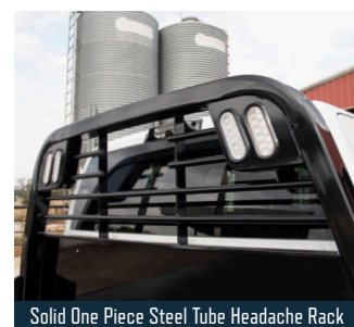
Solid One Piece Steel Tube Headache Rack