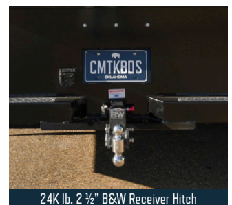
24K lb. 2 1/2" B&W Receiver Hitch