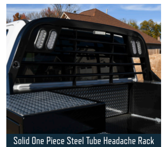
Solid One Piece Steel Tube Headache Rack