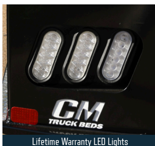
Lifetime Warranty LED Lights