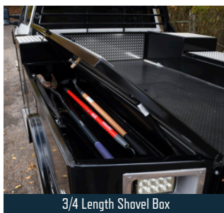
3/4 Length Shovel Box