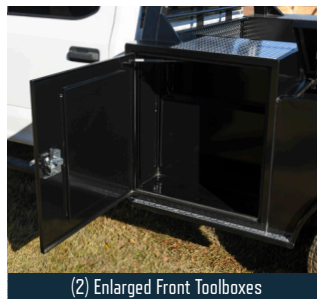
(2) Enlarged Front Toolboxes

NOTABLE OPTIONS INCLUDE: 3/16" Heavy-Duty Deck, 30K lb. B&W Hitch with Turnover Ball (Flush Mount Only); Bale Spikes; Color Primer Only; Work lights (Pictured)