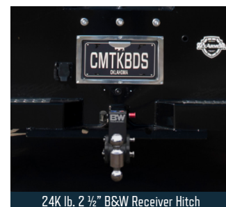
24K lb. 2 1/2" B&W Receiver Hitch