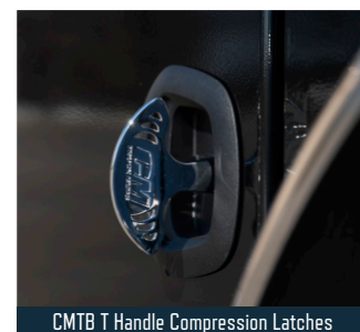
CMTB T Handle Compression Latches