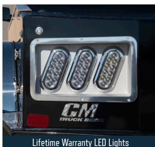
Lifetime Warranty LED Lights