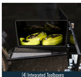
(4) Integrated Toolboxes