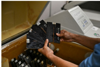
Mar and Scratch Resistance

The EpoxiShield system combines a zinc epoxy-based primer with a super-durable polyester top coat, creating a tough, resilient finish that resists corrosion, wear, and UV damage. Even after surface damage, EpoxiShield's self-sealing technology helps keep out moisture and prevents rust formation, dramatically extending product life and performance.