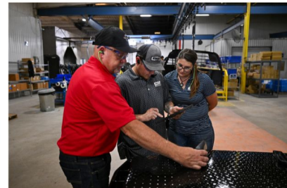
Gloss & Color Retention