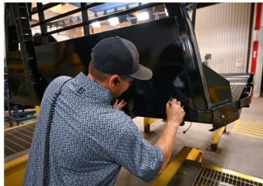
Adhesion Testing with a Crosshatch