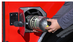
SS OXYGEN HOLDER W/CAST ALUMINUM (POLISHED) TRIM