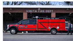
OPTIONAL PAINT COLORS WITH WHITE/RED/BLACK

■ OTHER NOTABLE OPTIONS INCLUDE: Center Compartment Passthrough Storage