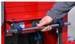
ALUMINUM HANSEN ROLL-UP DOORS