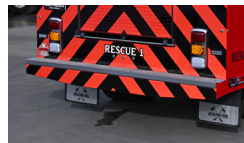
ALUMINUM GRIP STRUT BUMPER W/TAPERED DEPARTURE ANGLE